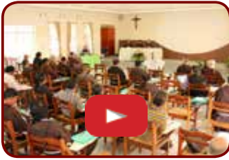
PACC n 1