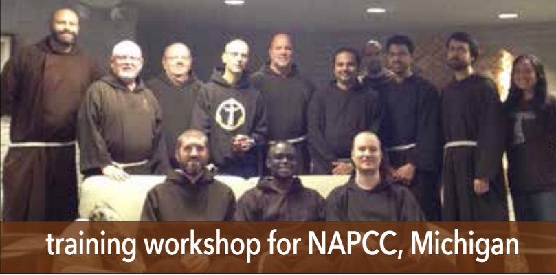
training workshop for NAPCC, Michigan