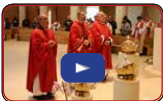
Collegio San Lorenzo