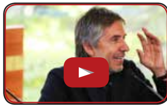
2015 11 11 VIII CPO La grazia di lavorare. Roma 2015