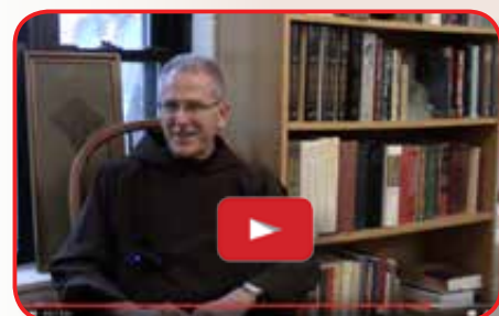
Video presentation of the 125th anniversary of Capuchin presence in Yonkers, New York, USA

God in religious life. The novitiate is the second stage of formation for Capuchin friars, during which they live a period of more intense initiation and a deeper experience of the gospel life according to the Capuchin-Franciscan charism – so we read in the description of the video that the North American Capuchin novices and staff have made.