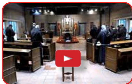
Young men continue to sense the call to consecrate themselves to

Our friars are all over the world living the Capuchin-Franciscan vocation. The Lord grants us to live the same charism, even though the life of the people in the many countries where we are can be very different. In this way the richness of the diversity of our charism flourishes in its diffusion all over the world. We invite you to check out some materials the friars from different continents have published.